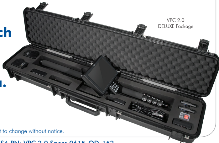
VPC 2.0 DELUXE Package

Inspect hard to reach areas with the portable VPC 2.0 Video Pole Camera.