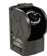
Black and White Camera Head