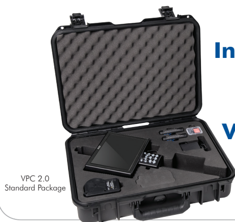
VPC 2.0 Standard Package